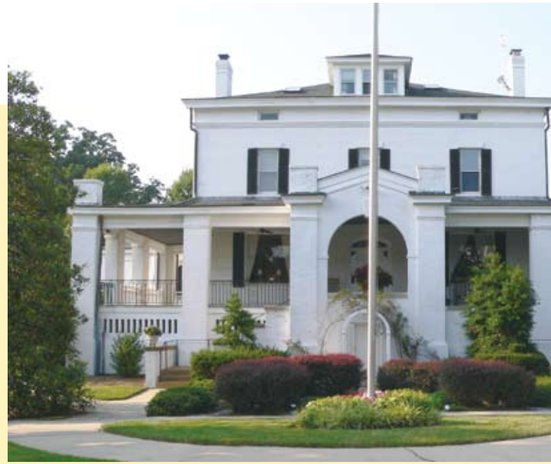
Front and Back View of the Building